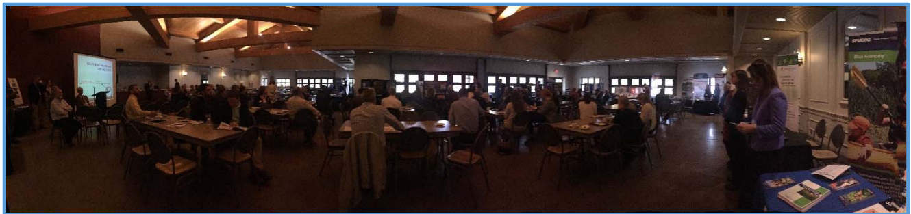
Great Lakes Restoration celebration hosted by the ARC at The Henry Ford

ARC Staff prepared an abstract submissions for the Great Lakes and St. Lawrence Green Infrastructure Conference that is planned for May 2017.