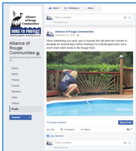
ARC Facebook Page

ARC Staff initiated a Facebook page for the ARC in 2016. During 2016 ARC Staff posted 14 public education messages and photos to educate the public on ways to protect the Rouge River.