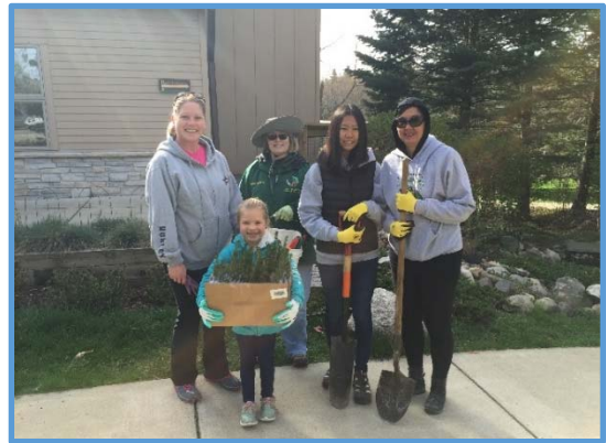
Tree seedlings at Bloomfield Twp. Rouge Rescue