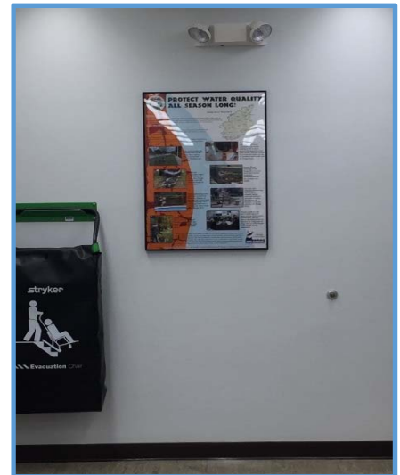
Oakland County facility displaying the ARC's seasonal poster

Staff designed and developed four (4) seasonal posters in 2016 with specific activities that the general public can do at home during the spring, summer, fall and winter to help protect water quality. A total of 250 of each seasonal poster were ordered. 900 posters were distributed to all 36 ARC Member communities and 5 cooperating partners giving each member and partner 5 (five) posters of each season. It was suggested that ARC members post these in support of their permit requirements in facilities, libraries or other buildings that the general public frequent. 100 posters were also distributed at the Great Lakes Restoration celebration event.